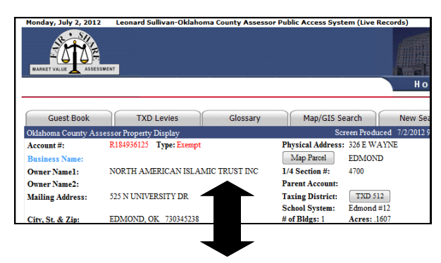
"The government has produced ample evidence to establish the associations of ISNA (Islamic Society of North America) NAIT (North American Islamic Trust)...with Hamas."

This has nothing to do with the First Amendment. This is about treason and sedition. The citizens of Edmond do not support Hamas or the Muslim Brotherhood and we certainly don't support the overthrow of the United States Constitution.